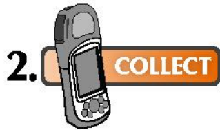
Archer Field PC