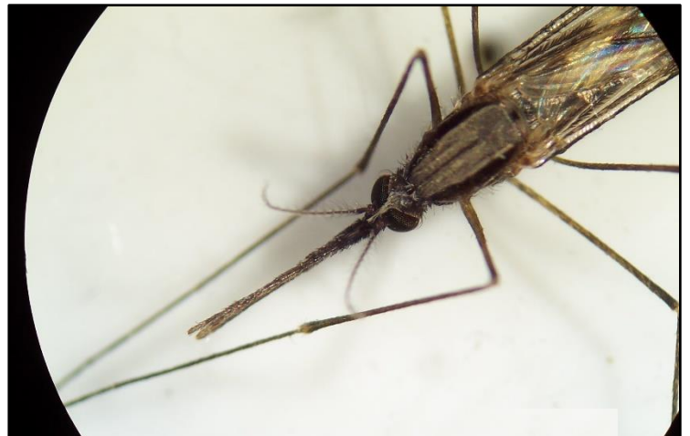
Anopheles punctipennis