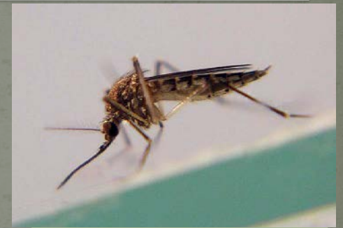
Ae. vexans & Ps. columbiana